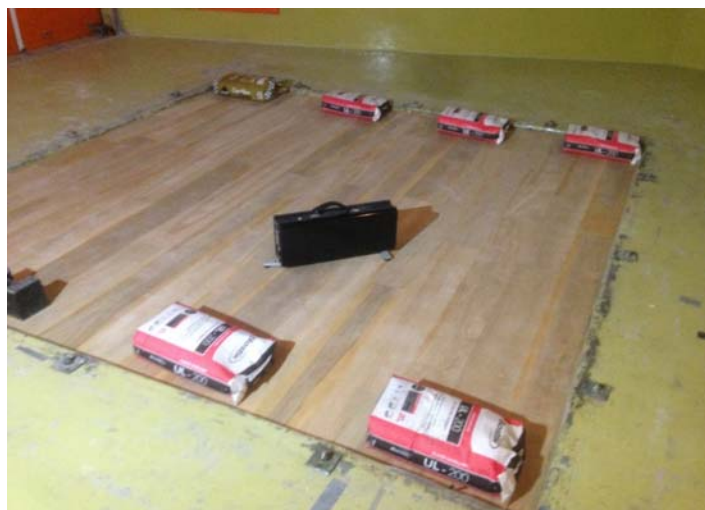
Figure 5: Tapping machine positioned on the test floor