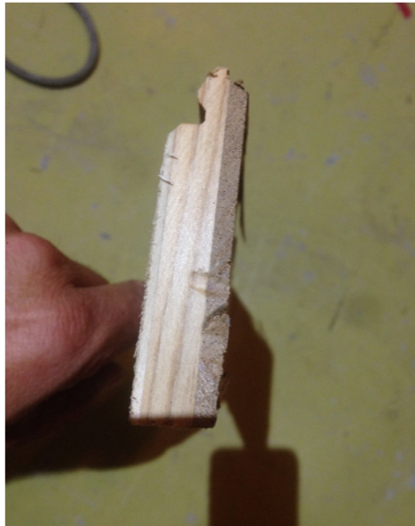
Figure 2: Cross section of oak flooring