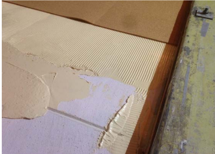
Figure 1: Cork being adhered to the Rockcote flooring panels