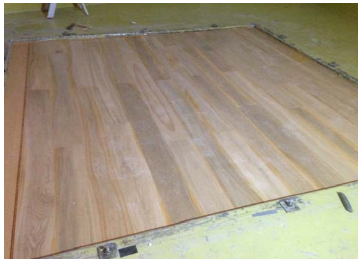
Figure 4: Finished floor with oak flooring panels