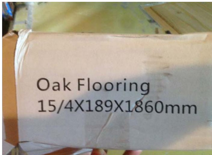
Figure 3: Oak flooring packaging